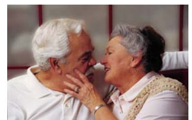
Support for Older Carers

For more information or help to attend please call Ulalee at Carers Lewisham 020 8699 8686