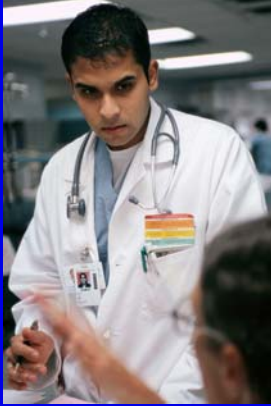
When you are ill make sure you go to the right place